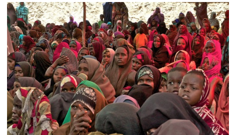
Kerberos conducting CVE activity in Somalia